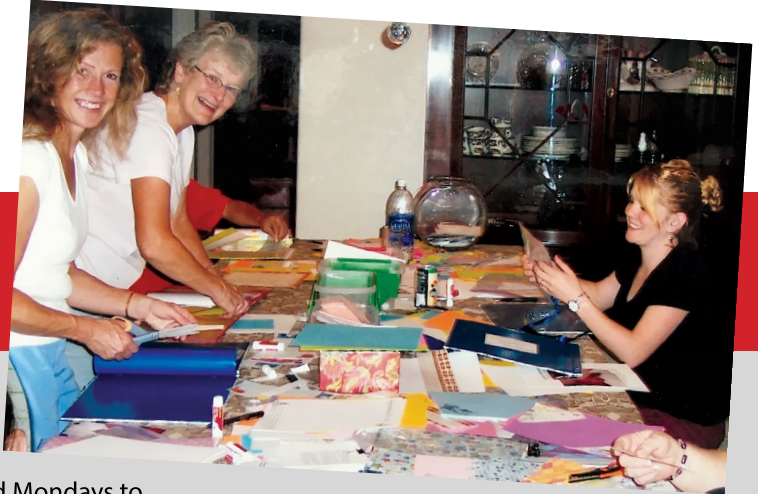
Pictured above: Monday evening volunteers during Memory Book early years. Who are these lovely ladies? First person to identify them in an email to info@memorybooks4children.com receives an autographed copy of the soon-to-be-released children’s book, I Am Chosen!

I am forever grateful to all my dear friends and family for believing in something so simple. We all realized that God still uses dead wood to perform miracles as He did with Moses’ wooden staff. God whispered to me