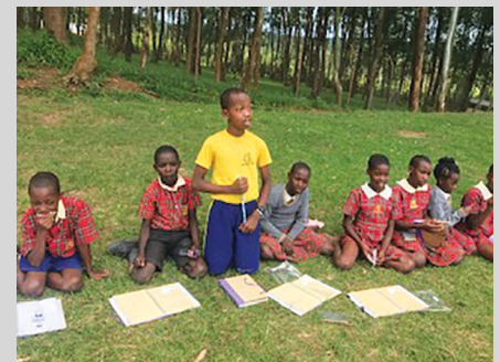
Attentive listening while the child with the talking stick gets a turn to share during Memory Book Club.