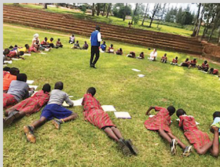
An adult facilitator (in blue vest) encourages and affirms children during Memory Book Club.